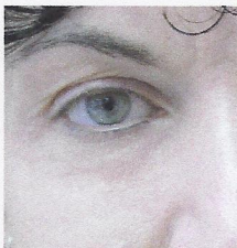
1 week after treatment